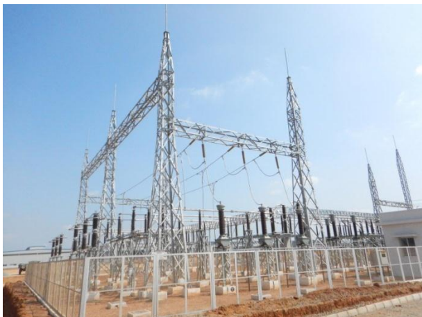
Transformer without primary power connection

In Vallam Vadagal, Yamaha and 8 Japanese Vendors will start production soon. But infrastructure such as Electricity, Water, Access Road is not ready yet.