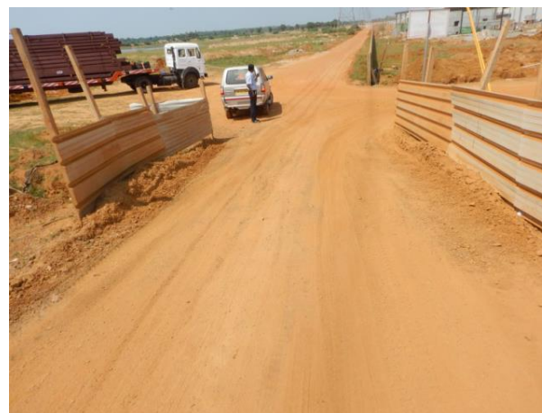
Unpaved access road